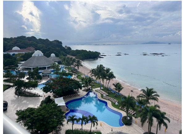
View from the 7 th floor of the hotel.

The social dinner was hosted at the Oceania room, facing the Pacific Ocean at The Westin Playa Bonita. The entertainment during the evening was excellent, with a very lively performance by a Tamborito folk group, showcasing regional pride and history. The dance floor was packed afterwards.