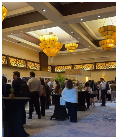
Coffee break in Panama

Finally, from the ADM board of directors to all members: thank you for your support and innovation in research in Dental Materials! If you have suggestions to the board, please send them our way. The amazing power of this membership is its commitment to keep promoting dental materials science. See you in Tokyo!