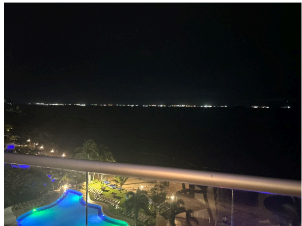
Line of ship at night waiting to cross the Panama Canal.