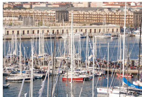
Trieste, Italy was a wonderful and accessible venue for the 2010 Annual Meeting